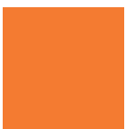
Pantone 158 C