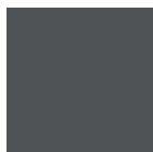
C: 60 M: 50 Y: 47 K: 40

The Social Enterprise Disability Employment Marks brand personality is personable and modern yet based on expert and reliable foundations. The colour palette needs to bring this to life. The Social Enterprise Disability Employment Mark corporate colours are yellow and orange.